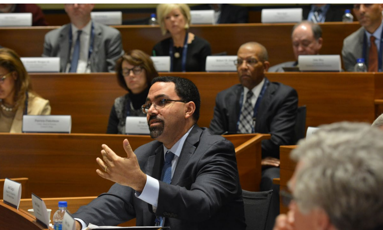
John B. King Jr., 10 th U.S. Secretary of Education; President & CEO, The Education Trust