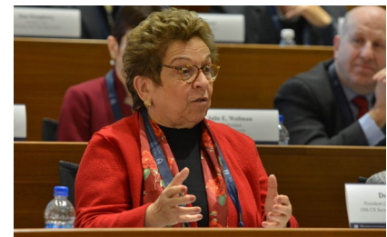
Donna E. Shalala, 18 th U.S. Secretary of Health and Human Services; President, University of Miami (2001- 2015)

It was an especially difficult period for the institution and the president, as criticism was coming from all sides – including students, faculty, alumni, trustees, and the media. Due to social media, when a narrative gets into the public conversation, even if it is inaccurate and untrue, it is very difficult to have people understand a counter-narrative.