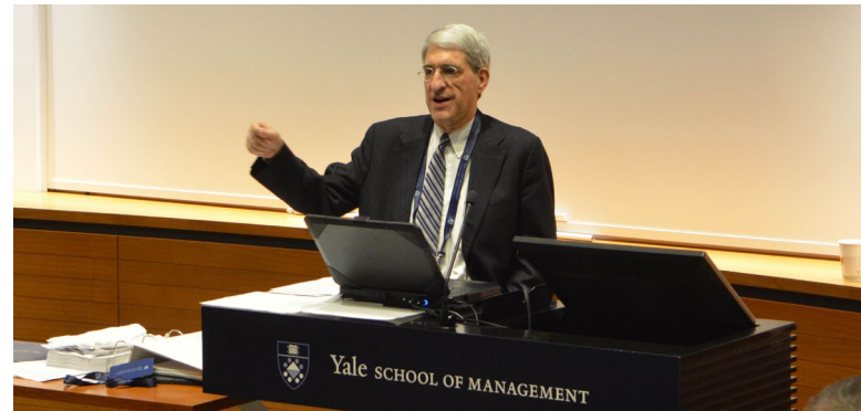
Peter Salovey, 23rd President, Yale University

Yale, for example pays $2 billion per year in wages and benefits, and has an overall economic impact of about $8 billion. Yale pays taxes that support New Haven, has a home buying program to support employees who want to live in New Haven, and has created the New Haven Scholars program to support students from New Haven in getting a college education.