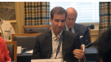
Luke Bronin, Mayor, Hartford, CT