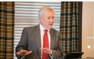
James Fallows, National Correspondent, The Atlantic , Author, Our Towns