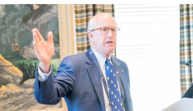
David M. Walker, United States Comptroller General (1998-2008)

Per David Walker, the federal government is on an imprudent, unsustainable financial path, as are some states and municipalities. The bad news for cities, which are on the bottom economic rung, is that bad news flows downhill. The federal government’s financial woes put more pressure on states, which in turn have fewer resources to support cities. Mayors and cities must understand this reality and prepare accordingly.