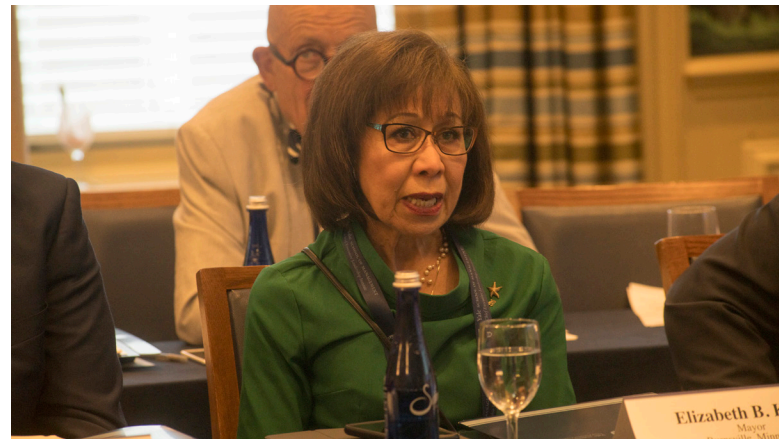
Elizabeth Kautz, Mayor, Burnsville, MN