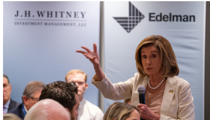
Nancy Pelosi, Speaker Emerita, State of California; Former Ranking Member, House Intelligence Committee

“We have to have regulation and we have to have guardrails, yes. But not to neglect making matters better as we go forward.”