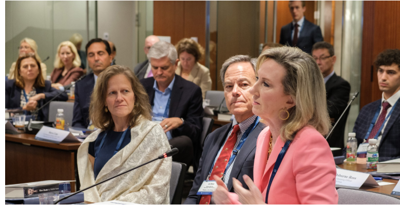
Barbara Comstock, Member of Congress (2015-2019), Commonwealth of Virginia

A former member of Congress commented that the Department of Justice has been aggressively bringing antitrust cases. While these cases are supposedly aimed at helping consumers, the DoJ has lost several recent cases, and the view of some business leaders is that it is overreaching. The Google antitrust case that is currently underway bears paying close attention to.