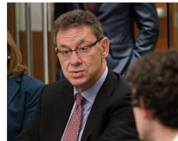
Albert Bourla, Chairman and CEO, Pfizer