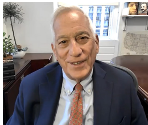
Walter Isaacson, Author, Elon Musk ; Former CEO, CNN; Former Editor-in-Chief, TIME ; Former CEO, Aspen Institute; Tulane Professor

"One of the parallels [among disruptive geniuses] is the ability to think differently."