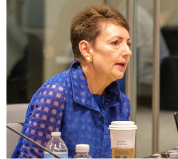
Lynn J. Good, Chair, President & CEO, Duke Energy Corporation

Progress is also being made possible through the use of new digital tools and technologies at the edge of the electrical grid.