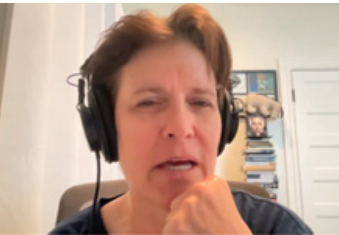
Kara Swisher, Writer, Entrepreneur, Podcaster

Another issue in this digital, AI era is the question of data ownership. Who owns a consumer's data? What protections are provided to consumers for their data? These questions and others about data ownership, privacy, security, and safety may be part of regulation, but will definitely be top of mind for years to come.