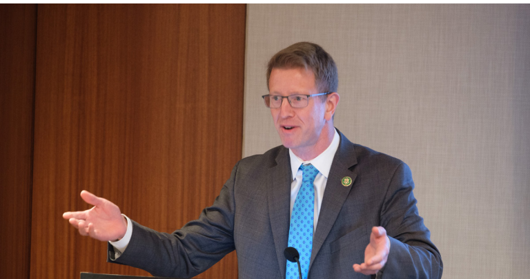
Derek Kilmer, Representative, State of Washington; Chairman, House of Representatives AI Working Group