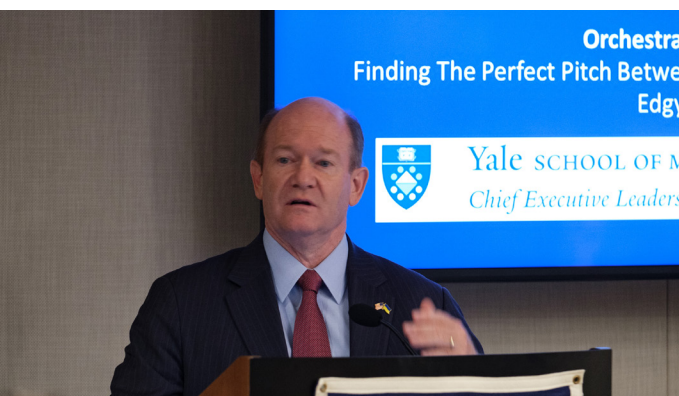
Christopher A. Coons, Senator, State of Delaware; Small Business & Entrepreneurship Committee

Senator Christopher Coons highlighted a few accomplishments of the Biden Administration, including passage of the CHIPS and Science Act, which is investing $52 billion in semiconductor chip manufacturing, with a four to one match in private investment. This is leading to reshoring of jobs and creation of highly skilled manufacturing jobs across the country. Also noteworthy is the Inflation Reduction Act, the Bipartisan Infrastructure Deal, and the Veterans Benefits Improvement Act, which marks the biggest expansion of veterans’ care in US history.