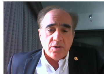
David Shulkin, 9 th Secretary, US Department of Veterans Affairs

The CEO of a major pharmaceutical company concurred that AI will improve how drugs are developed and how companies operate. In fact, AI helped expedite the development of vaccines and treatments for Covid. This company is betting heavily on developing treatments for cancer and is bringing 19 new products to market in the next 18 months, along with making several strategic acquisitions.