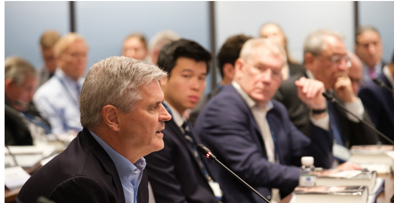
Steve Case, Chairman & CEO, Revolution; Founder & Former CEO, America Online

"I invite your collaboration. Government cannot and will not solve this on its own."