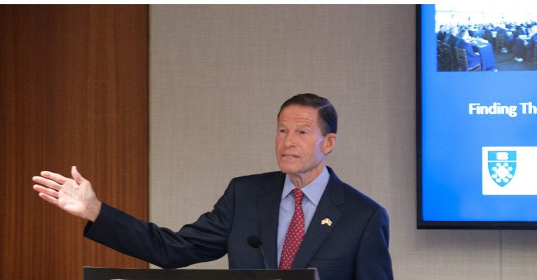
Richard Blumenthal, Senator, State of Connecticut; Chairman, Judiciary Subcommittee on Privacy & Technology

“Regulation of AI is coming. The only questions are when, what, how soon, and what will it be.”